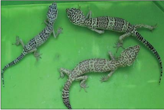
Fig. 1. Three leopard geckos (two females and 1 male) received by veterinary practitioners from a breeder colony in Buenos Aires, Argentina with a history of diarrhea, anorexia and cachexia.