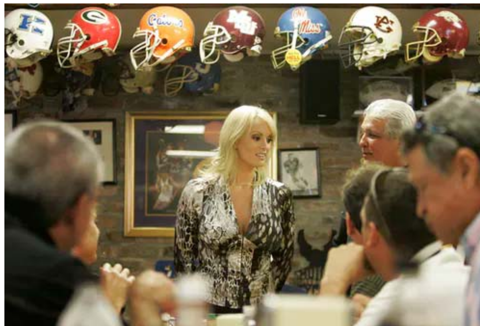
Stormy Daniels, an adult star, at a local restaurant in downtown New Orleans.