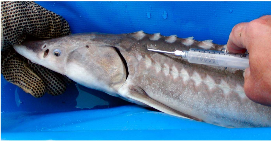
Figure 4. Illustration of the preferred location of PIT tag application on a juvenile White Sturgeon. The PIT tag is injected just beneath the skin, about 1 cm behind the head plate, on the left side of the dorsal scute line. Photo: Fraser River Sturgeon Conservation Society. doi:10.1371/journal.pone.0071552.g004

identified the timing and location of spawning, a topic of obvious interest to those working on conservation of sturgeon. These studies have relied on both acoustic and radio tracking, often in combination, and typically have made use of mobile tracking to detect tagged sturgeon. A related type of study examines the movement and habitat use of cultured sturgeon after release.