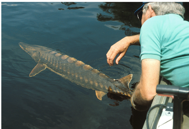
Figure 1. Gulf Sturgeon ( Acipenser oxyrinchus desotoi ). Photo: Joe Hightower. doi:10.1371/journal.pone.0071552.g001

Sturgeons may move from one location or habitat type to another to feed, reproduce, or overwinter. River movement can be complex and include multi-step migrations [10] and include movement between and among rivers suggesting a meta-population structure [11]. Within a species, populations can differ on the timing of migrations into river systems, time spent within the river (holding), and the distance (upstream) from the marine environment where spawning occurs. Directed migrations from overwintering locations to feeding habitats, in some cases timed to intercept specific, localized prey species, may be a population-based behaviour; other populations of the same species may