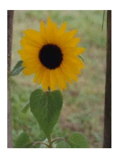
Fig. 5. Stego-Image containing secretly embedded message