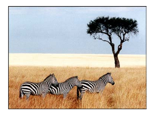
Fig. 2. Stego-Image containing secretly embedded message

The secret message is revealed by extracting the embedded message and applying the decoding as explained above. The decoding of the embedded message reveals the secret message "Pershing sails from NY June 1".