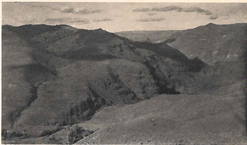
A—Looking down Rock Creek (middle foreground) and valley of John Day River (in distance) below Picture Gorge. Mature topography; 2,000 feet relief. Ochoco Erosion Surface largely destroyed; probable remnants on skyline in center.