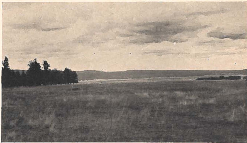
B—Big Summit Prairie, on the gentle south slope of the Ochoco Range, 15 miles south of Mitchell, Oregon. Looking northeast. Tributaries of the John Day River are invading this old-age surface vigorously from the north. This region is the type area of the Ochoco Erosion Surface.