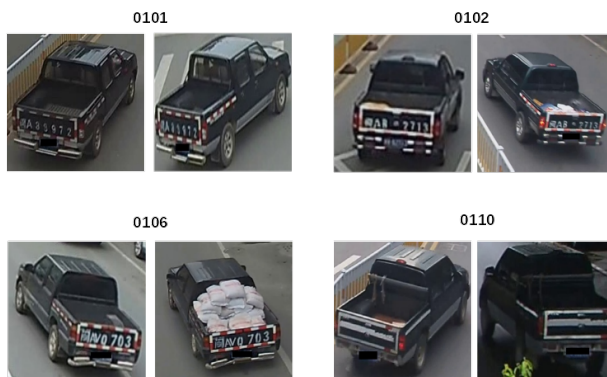
Figure 1. Examples of similar vehicles with their identity numbers in VeRi-776 dataset [19]. These pickup trucks have almost identical model and color, which makes vehicle Re-ID extremely challenging. One possible solution is to extract more discriminative local features from distinct regions.

License plate number is naturally the most crucial information for people to recognize a vehicle, which has been widely applied in real-world traffic flow analysis systems. However, due to low resolution cameras, occlusions