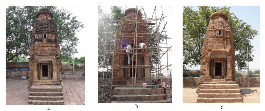
Fig. 4. Sita Devi Temple front view with stairs: a - before conservation; b – during conservation, c – after conservation