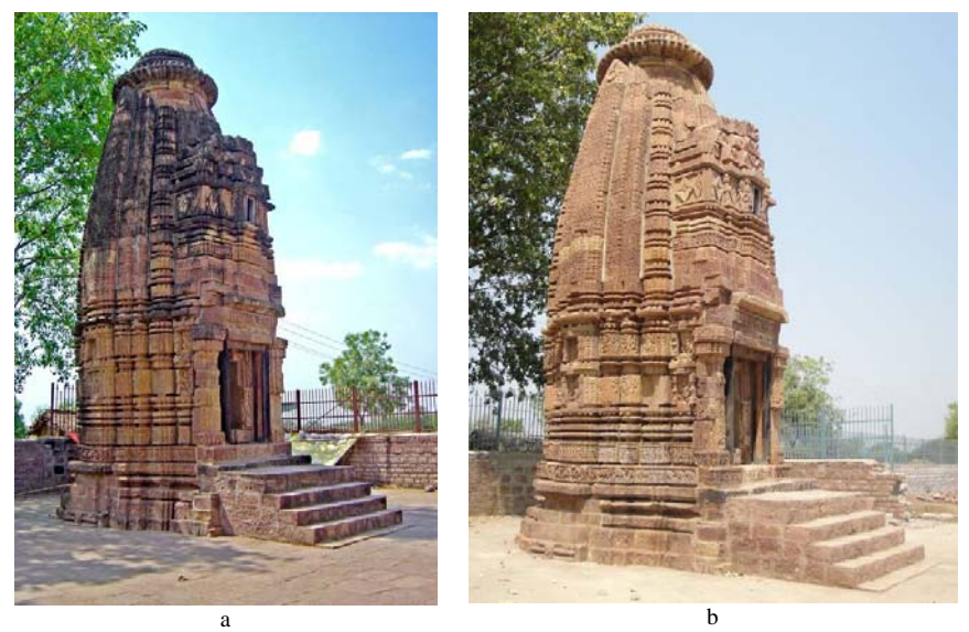
Fig. 1. Sita Devi Temple: a - before conservation; b - after conservation

These beautiful monuments, consist of thousands of sculptures and paintings. Most of them date from the 9<sup>th</sup> to the 11<sup>th</sup> century. The architectural beautifulness is amazing but there are environmental factors that cause deterioration [1]. The harmful effect of the microorganisms colonizing the monuments is scientifically known as biodeterioration. So the original beauty and gracefulness are affected and slowly, in time, they diminish the value. If proper measures are not taken, these remains they may collapse due to moss, fungi, lichen etc. Fungi play an important role in the biodeterioration of monuments [2]. The biodeterioration of ancient buildings and monuments depends on many factors, including environmental factors like light, moistures, weather, temperature and certain types of micro-organisms. All these equally contribute to the biodeterioration of any monuments. The phototrophic microorganisms are common inhabitants of monuments.