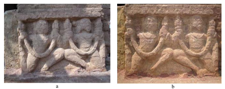
Fig. 2. Sita Devi Temple detailed structure: a - before consolidation; b - after consolidation