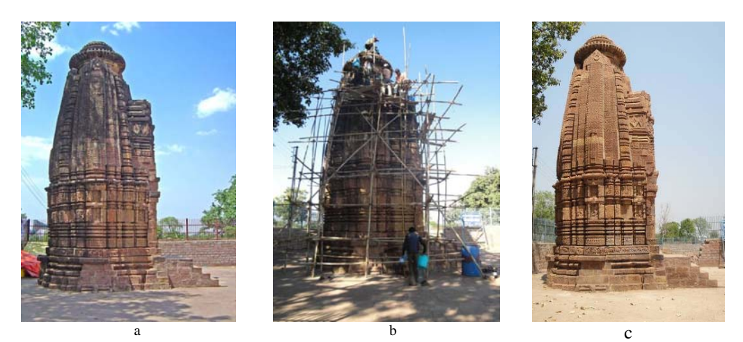
Fig. 3. Sita Devi Temple lateral view: a - before conservation; b - during conservation, c - after conservation