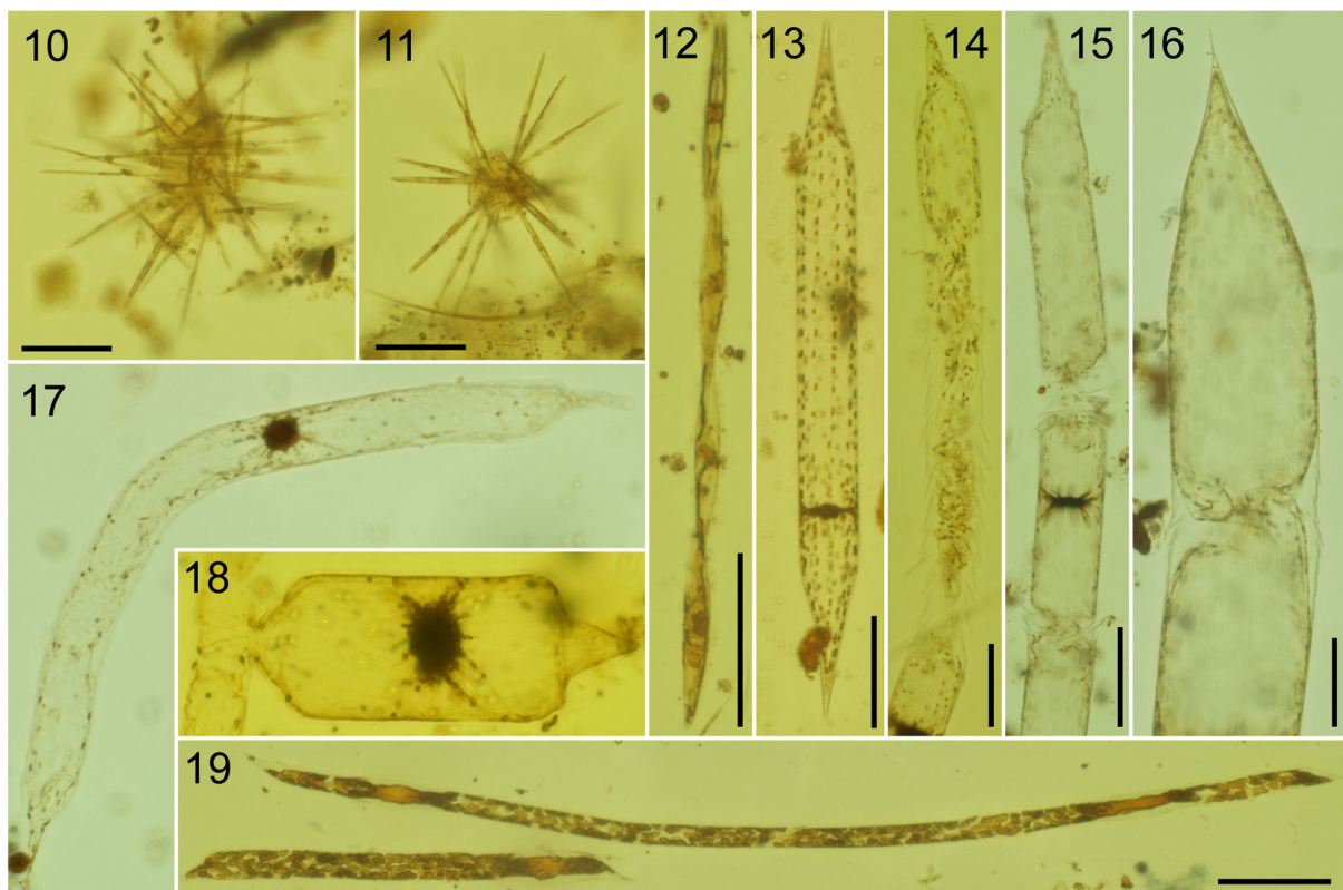
Fig. 10–19. Photomicrographs of microphytoplankton in the SE Pacific. (10–11) Clusters of Pseudo-nitzschia delicatissima , 20 m and 30 m depth. (12) Pseudo-nitzschia cf. subpacificica , 5 m depth. (13) “Normal” cell of Rhizosolenia bergonii , 60 m depth. (14) R. bergonii with fragmented frustule, 20 m depth. (10–14) 8°23' S; 141°14' W. (15) R. bergonii with fragmented frustule, 30 m depth. (16) Rhizosolenia acuminata , 5 m depth. (14–16) 9° S, 136°51' W; 30 and 5 m depth. (17) Curved cells of R. bergonii (13°32' S, 132°07' W, 5 m depth). (18) Auxospore of R. bergonii , 33°21' S, 78°06' W, 5 m depth. (19) Highly pigmented cells of Rhizosolenia sp. (17°13' S, 127°58' W, 210 m depth). Scale bar=50 \mu\text{m} .

the phytoplankton biomass. Other common centric diatoms were Chaetoceros peruvianus (200 cells \text{l}^{-1} near surface), Chaetoceros atlanticus var. neapolitanus , Planktoniella sol , Bacteriastrium cf. elongatum and Asteromphalus heptactis .