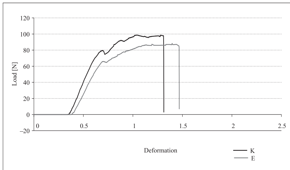
Figure 1. Typical load-deformation in the femur shaft bending three point test in the groups of animals; K — control group; E — pregnant females with caffeine applied

physes and contained within the physiological fluids ( m_i ) was assessed, then the mass of the dry bone ( m_s ). The dry bone mass was determined after drying the sample of bone at 105°C for 24 h. For the determination of the organic and mineral phases, bone samples were ashed in a muffle furnace at a temperature of 630°C for 24 hours, and then incinerated samples were weighed ( m_a ).