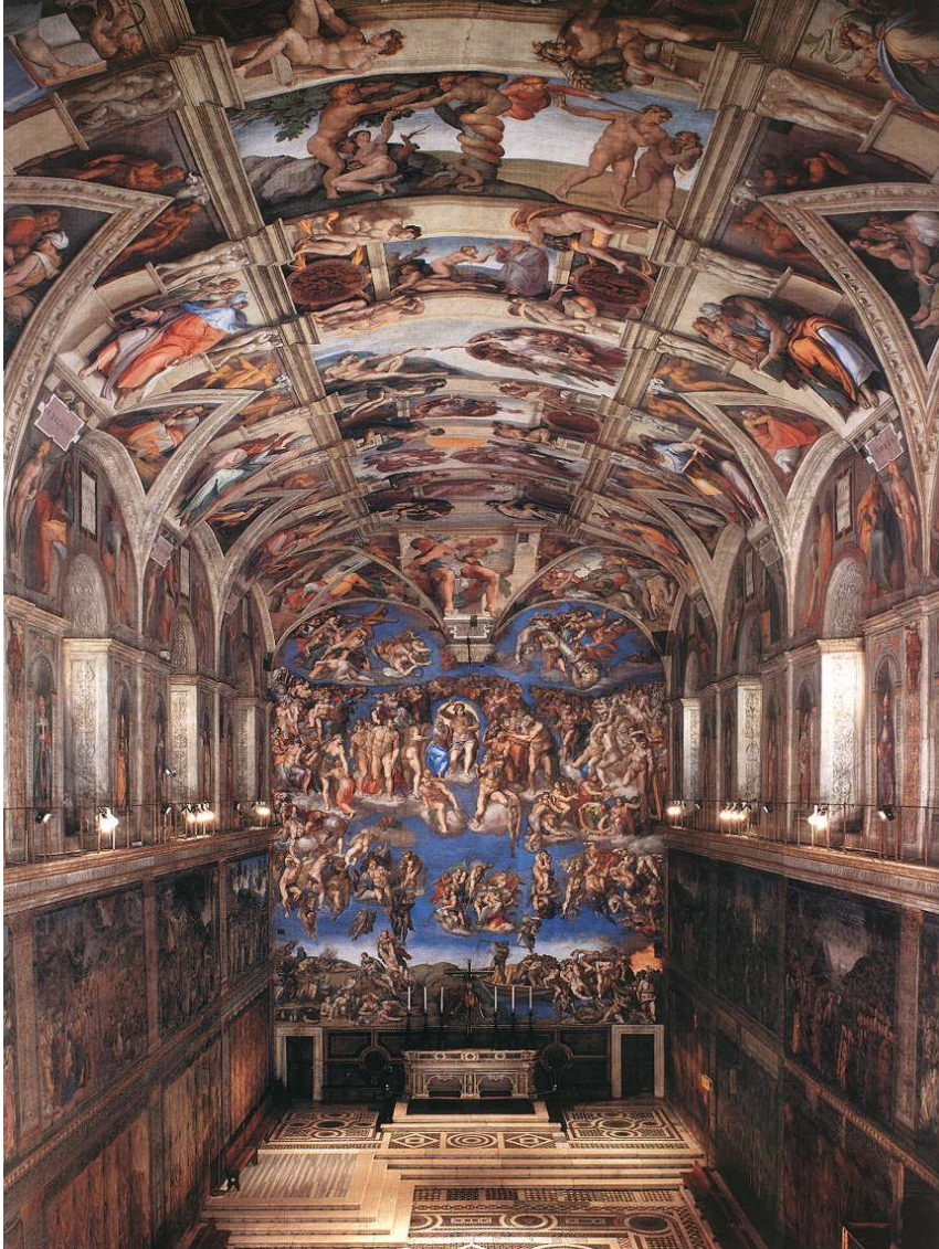
Figure 3. Sistine Chapel showing altar wall painted by Michelangelo, 1535-41. Its design respects the horizontal divisions of the walls and ceiling.

for they are painted on the deep concave haunch of the vault. The smaller of the individual episodes of the narrative at the crown of the vault are centered above the heads of the prophets and sibyls; their scale and framing lead our eye across the vault along the transverse ribs.