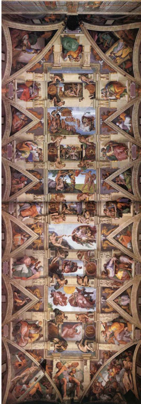
Figure 2. Michelangelo, Panoply of the Sistine Chapel Ceiling, Vatican. 1508-12.