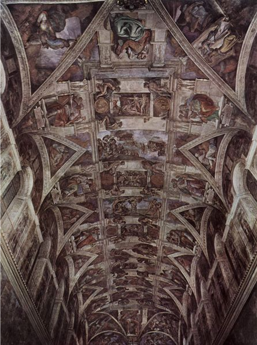
Figure 1. Michelangelo, Sistine Chapel Ceiling, before cleaning.

necessary background for any intelligible treatment of Michelangelo's work". 9