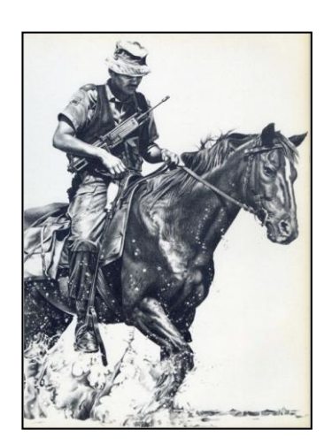
Figure 5: Across the Pan

The horse's relative silence, heightened sensory perception, terrain-versatility and speed proved more useful in certain contexts than the foot soldier and armoured vehicles. The ultimate goal of mounted infantry units stationed in SWA was to patrol, track and kill SWAPO insurgents' crossing over the Angola-Namibia frontier. The dynamic internal challenges to the state presented an altogether different application of mounted infantry, which was to see its role change radically from one whose sole raison d'être