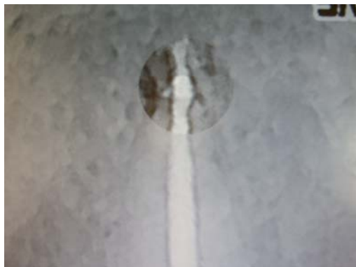
Fig. 3 – A zoomed apical region (2X) with the applied contrast effect – a clear radiopaque field of an overfilled gutta-percha mass was presented as oblique rectangle in the region of the apical foramen. A mass over it is noted as a number-eight-shaped slight shadow area and presents an endodontic sealer

more contrasted field than endodontic sealer. Due to the mild sensitivity to percussion at the fifth visit the patient was advised to have analgesic oral administration in the next three days as an integral part of endodontic procedure. After that period, obturated tooth was less sensitive to lateral and vertical percussion test and almost without any symptoms in the next week.