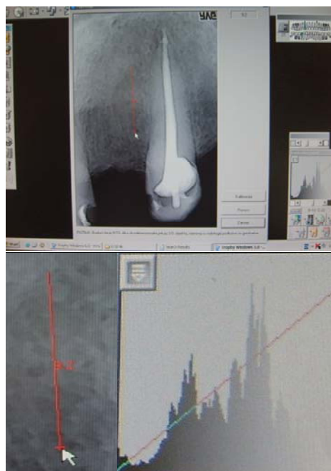
Fig. 5 – A marked, bigger diameter of elliptic resorptive alveolar bone lesion by the ruler in the condition of repairation was subjected to densitometric analysis. A histogram is placed at the middle right margin of the figure

Densitometry analysis of adjacent mesial part of alveolar bone gave a histogram presented in Figure 5. A ruler from the service tool bar enabled measuring the longer diameter of elliptic bone defect as 9,2 mm and discerned various bone density values. The distant points of the longer diameter were of the high density value. The remaining inner portion exposes decreasing density and lower values in the middle of diameter. These findings confirmed the histogram values shown in the right lower corner in Figure 5.