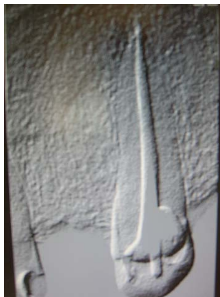
Fig. 1 – Radiovisiographic image with contrast effect of the upper right canine after root canal obturation made by the manual lateral-vertical technique of gutta-percha compaction

Radiovisiography revealed a slightly overfilled obturation mass and unclear ellipsoidal area in alveolar bone segment between teeth 13 and 11 (Figure 1). This finding and still tenderness to percussion provoked therapist to clear up the situation of that bone segment due to the possible causative factor (chronic bone lesion). Because of that, zooming in normal (without contrast) window format was made (Figure 2). In this way the situation was cleared up concerning the alveolar bone lesion at the place of the missing tooth 12 and apical part of the root. The bone lesion area was marked by a software ruler as 9.2 mm in diameter. Unfortunately, the patient forgot to tell us to have had tooth 12 extracted a few months before, causing the ellipsoid-shaped bone defect in that region to be noted clearer in Figure 1,