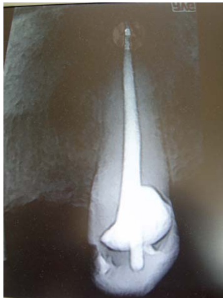
Fig. 2 – A marked area of the apical portion of the root for zooming in 'window' format

thus confirming the patient's own words that it was „a difficult and unpleasant intervention at tooth 12 with gross existing process“. Anamnestic data and symptoms were reasons to zoom (2X) the apical part and now exposed to contrast filter option thus giving the next display image (Figure 3), as well as to apply densitometry analysis later on. The analysis of the radiogram revealed overfilling of endodontic sealer beyond the root apex as the number-eight-shaped displayed slight shadow in apical area of the root (Figure 3). A certain amount of the sealer was exposed at the mesial side of the apical segment and visible as small ellipsoid light grey area. The denser gutta-percha mass reached the last millimetre of the canal exposing an oval rectangular field presented as the