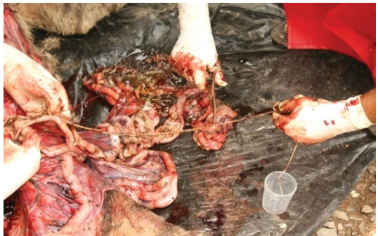
Fig.4: Teania hydatigena in intestine of tiger.