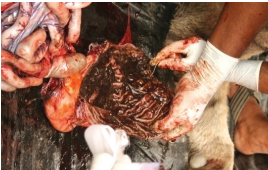
Fig.3: Toxocara cati found in stomach of dead tiger.