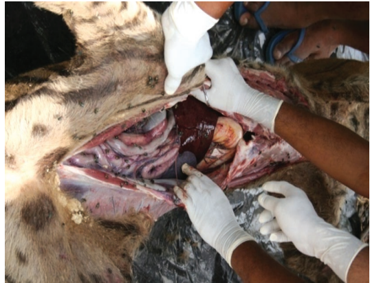
Fig.2: Gross-pathological changes of dead tiger during PM.