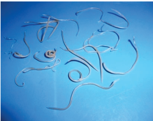
Fig.5: Toxocara cati obtained from intestine of tiger.