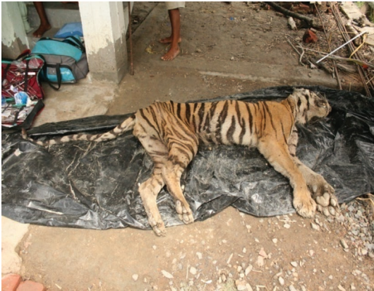
Fig.1: Physical observation of dead tiger before PM.