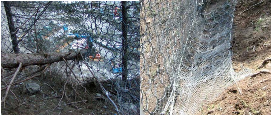
Fig. 1. (Left) tree impact into a rockfall protection barrier; (right) measures for preventing tree trunks from slipping through below the barrier.