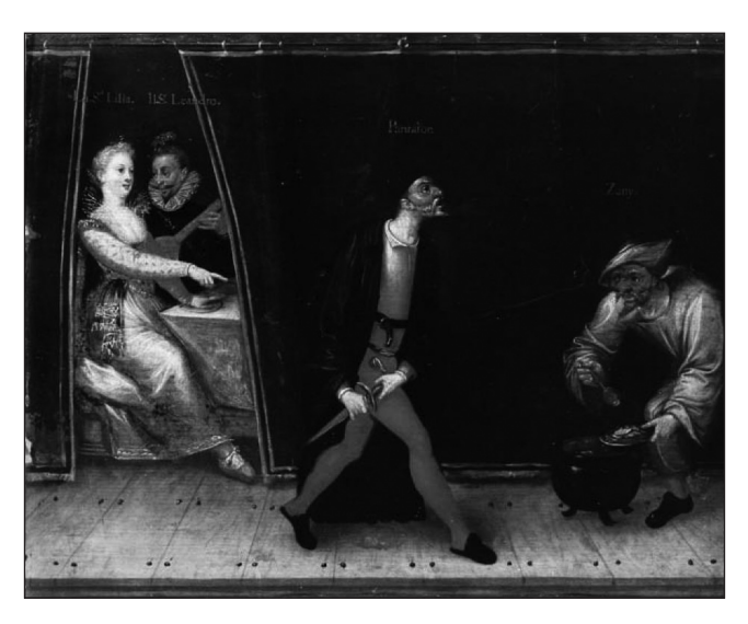
Fig. 3. Lilia, Leandro, Pantalon, Zany , oil on panel, 38 x 47.5 cm. Palacio Real de la Granja de San Ildefonso, Segovia (11980).