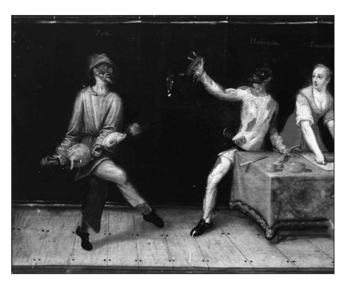
Fig. 2. Zany, Harlequin, Francisquina, oil on panel, 38 x 47.5 cm. Palacio Real de la Granja de San Ildefonso, Segovia (11978).