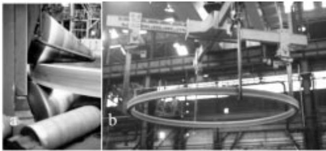
Fig. 2. A 6.8 m diameter ring during two phases of fabrication: (a) seamless ring rolling and (b) transfer of the rolled ring to the quench bath.