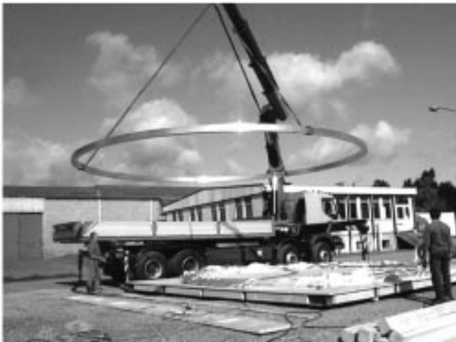
Fig. 3. A pre-machined ring during insertion in the shipment box.