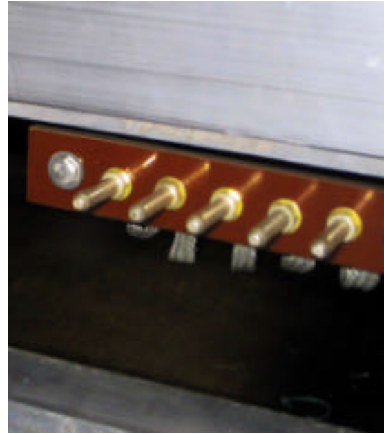
Figure 1. Left: Modulator Tank w/ 5045 klystron, Right: Multi-lam pins for ground

When the chassis is in place in the tank, a set of multi-lam sockets mounted on the inner chassis for grounding of the transformer secondary mates with the pins shown in the picture on the upper right. The pins are made floating to ensure that they properly mate with the sockets. The final ground is made by the short braid connections.