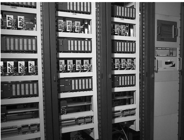
Figure 3: New control racks of the SPS north area target stations (3 targets) showing front-end PC (right) and PLCs and motor controllers (left).