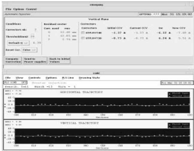
Figure 2. Graphics user interface for the PS injection

An example of the organization of the interface is shown in Fig. 2 for the PS injection. The screen contains the display of the beam positions, the input to the correction algorithm and the calculated currents ready to be sent to the correction power supplies.