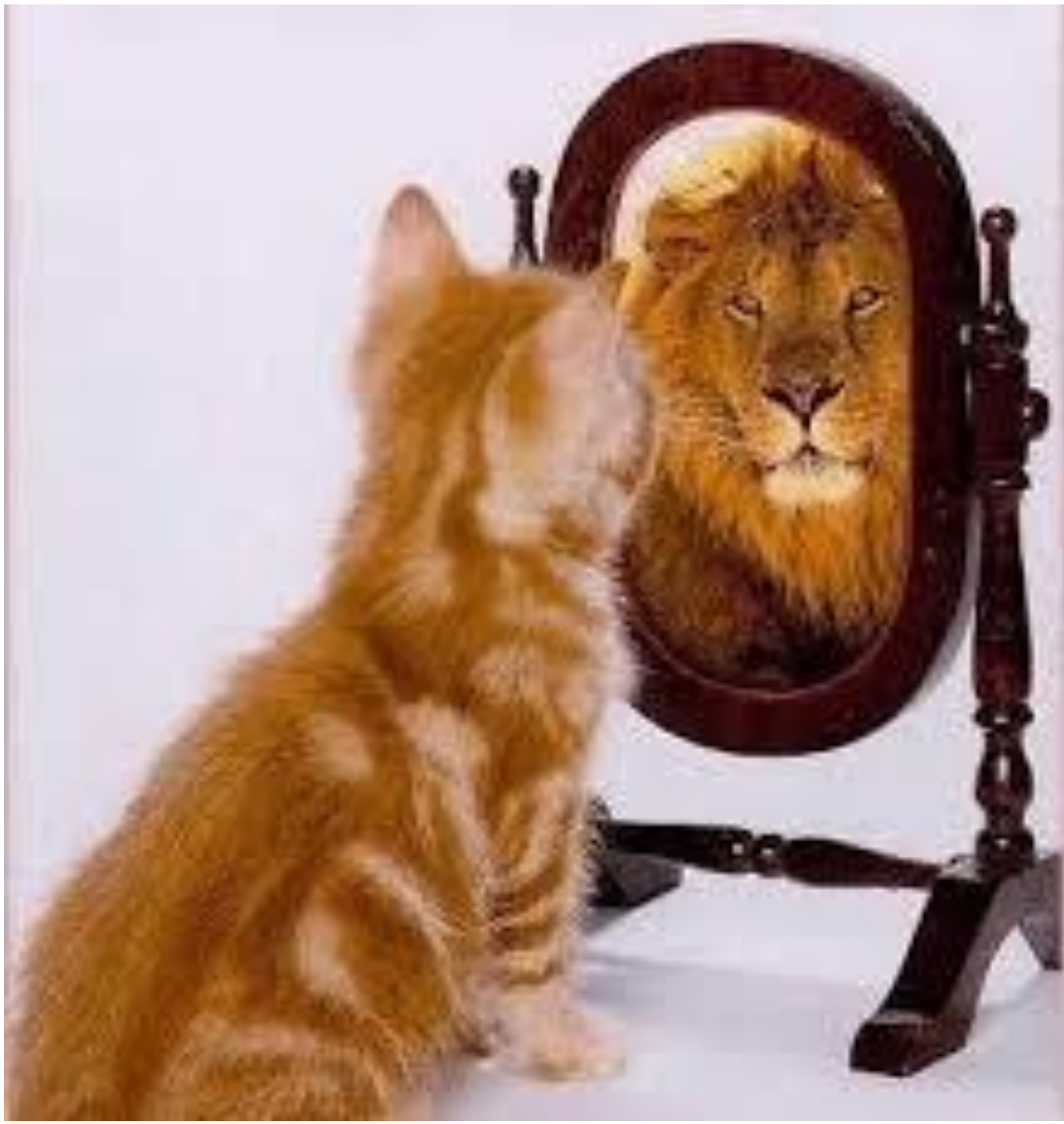
HTIBP: Characteristics of Highly Talented International Business Professionals *