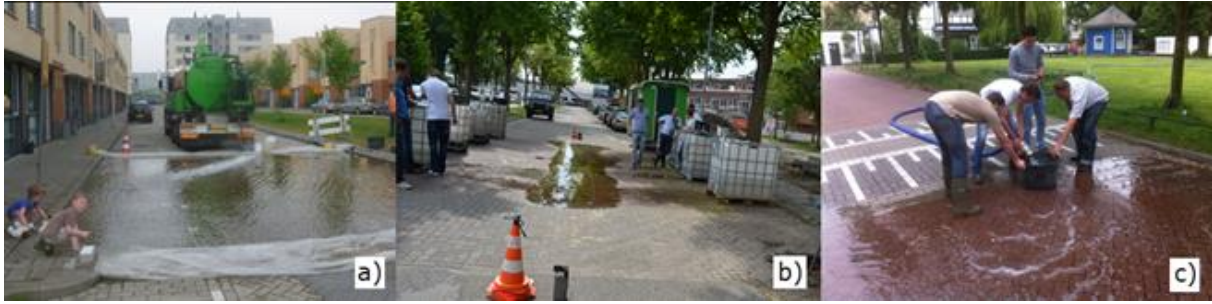
Figure 4 (a) Water truck supply; (b) Water tank supply; (c) Pumping from canal.