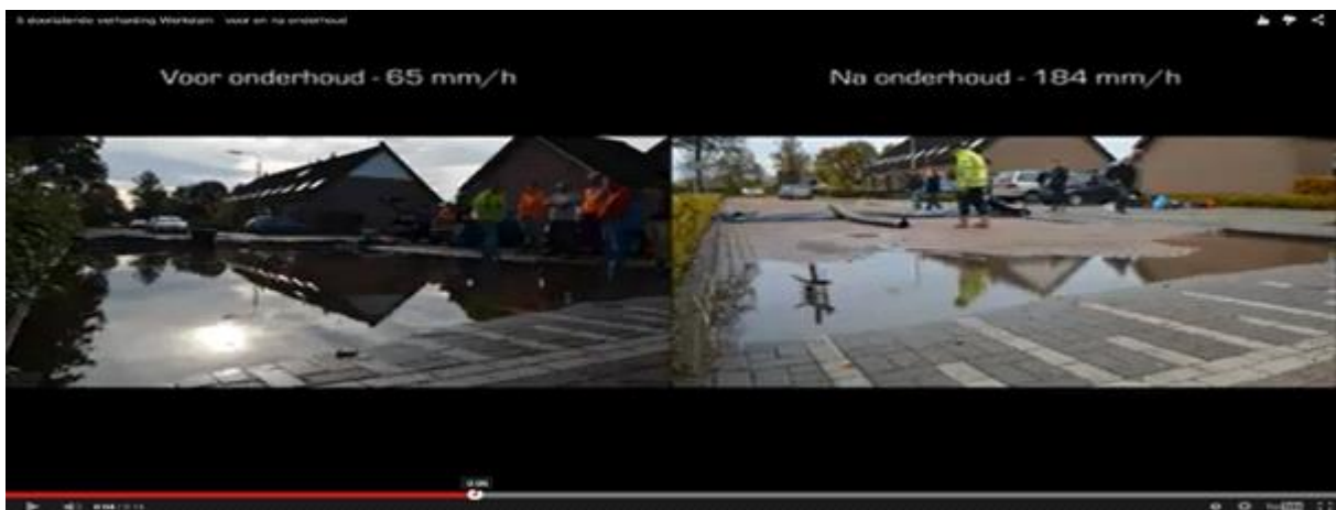
Figure 6 visualisation by time-lapse camera showed the infiltration capacity before and after maintenance of permeable pavement at the same time on video ( http://www.climatescan.nl/page?details=60 ). (Tipping, 2015)

Visualisation of the hydraulic behaviour of SUDS infiltration is recommended for understanding the conducted research and it contributed for a better understanding of SUDS by many actors (e.g. urban planners from water authorities and municipalities). This visualisation (Figure 6), which allowed real-time monitoring of the entire infiltration process, was useful as a logbook for the conducted experiments and also facilitated precise verification of the pressure transducer measurements.