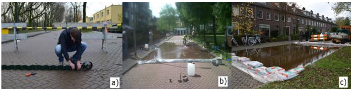
Figure 3 Various Dam Variations Used at the Different Test Locations (a) Impermeable barriers; (b) Plastic wrapped soil core; (c) Soil-filled plastic bags.