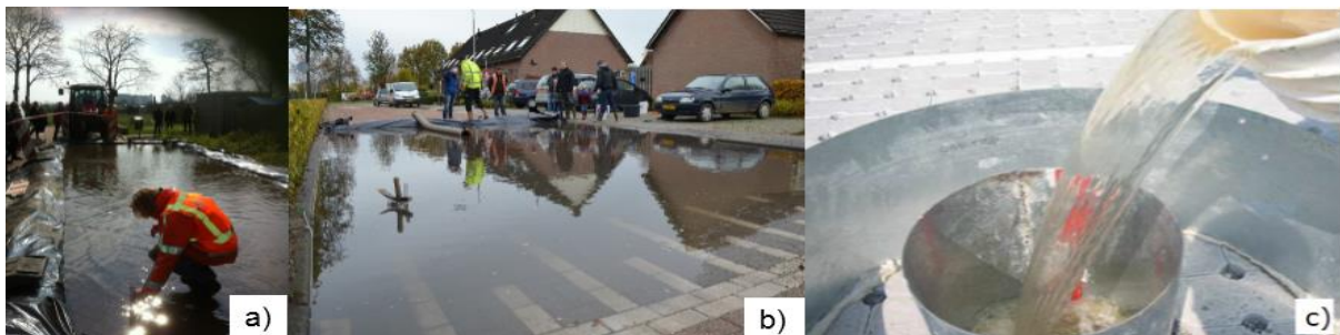
Figure 2. Full scale testing in the Netherlands (a) Impermeable barriers; (b) Plastic wrapped soil core; (c) DRIT testing

The permeable pavement infiltration testing methods described above are based on the infiltration rate through a very small area of the pavement that is used to represent the total pavement area infiltration. For example, the area of the inner ring of the ASTM D3385-09 DRIT test is 0.0707 m 2 . The minimum area recommended by the Dutch guidelines [Kiwa, 2014] is even smaller, at only 0.01 m 2 . Using such small areas for testing could potentially lead to erroneous results as a number of studies have demonstrated a high degree of spatial variability between different infiltration measurements undertaken on the same pavement installation. In the Netherlands, several infiltrometer tests have been performed on one location within 2 m 2 from each other leading to a high variation of results. Dutch results from four infiltrometer tests taken within 10 m 2 on one location in ‘Meijel’ showed a variation of between 34 and 596 mm/h and in Heerhugowaard only two tests were taken showing an infiltration rate of 825 and 3511 mm/h [Boogaard 2015].