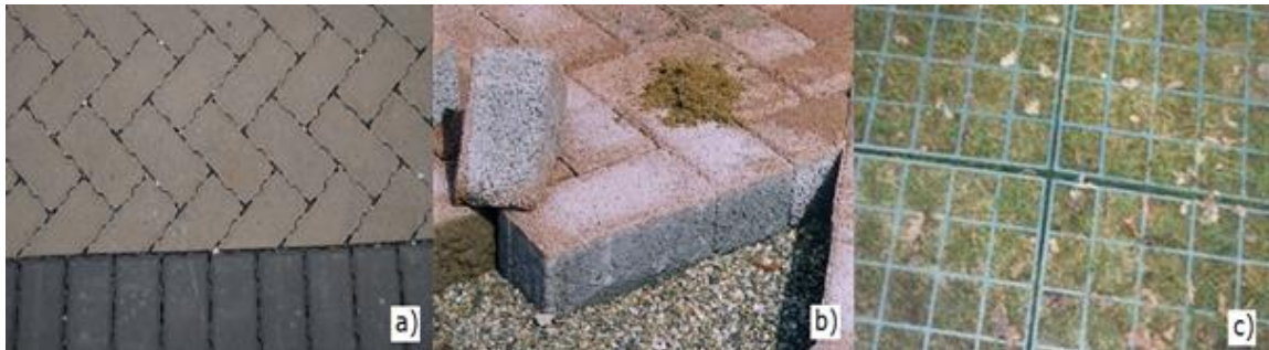
Figure 1 (a) Impermeable Concrete PICP; (b) Porous Concrete PICPs; (c) Grass-filled PICPs.

international locations after 5, 10 and 15 years, without maintenance. This paper presents the results of an extensive international review of research on the reduction of infiltration capacity of permeable pavements over time.