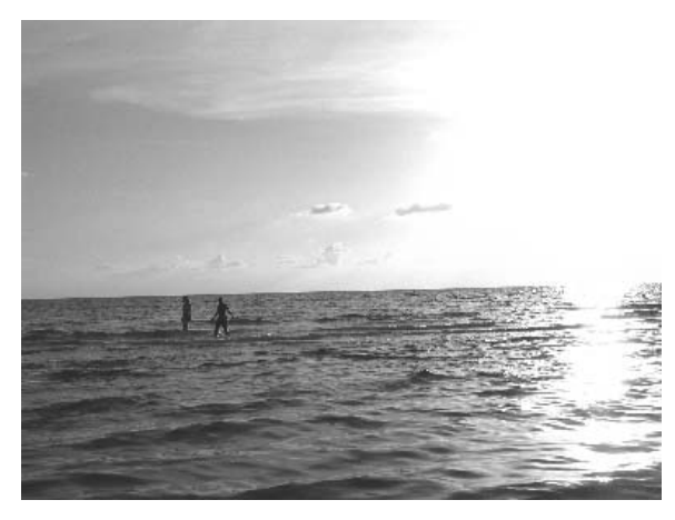
Librarians at Immersion '05 came away with renewed energy, a wealth of new ideas and the knowledge that the Immersion community will outlast the four-and-a-half-day marathon meeting.

in the room, commitment, courage, rebellion, intelligence, and personality—with a great deal of collegiality—that we learned as much from each other as from the Immersion leaders.