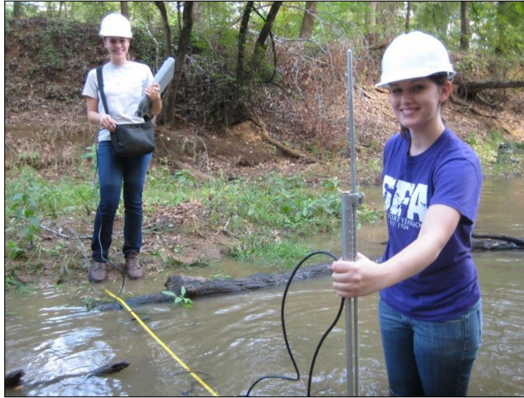
Figure 2. Students at Stephen F. Austin State University using water measuring equipment during field-based collaborative learning exercises.

Students were required to analyze and present their results at a college-level poster symposium and engage in active discussions of their results with other undergraduate and graduate students. Faculty in the college also discussed results with the students. The poster symposium was designed to engage students by combining three broad areas of competency needed by natural resources professions as mentioned above. Student attitudes were assessed with an end of course evaluation that included a qualitative section dealing with what the students found valuable about the course.