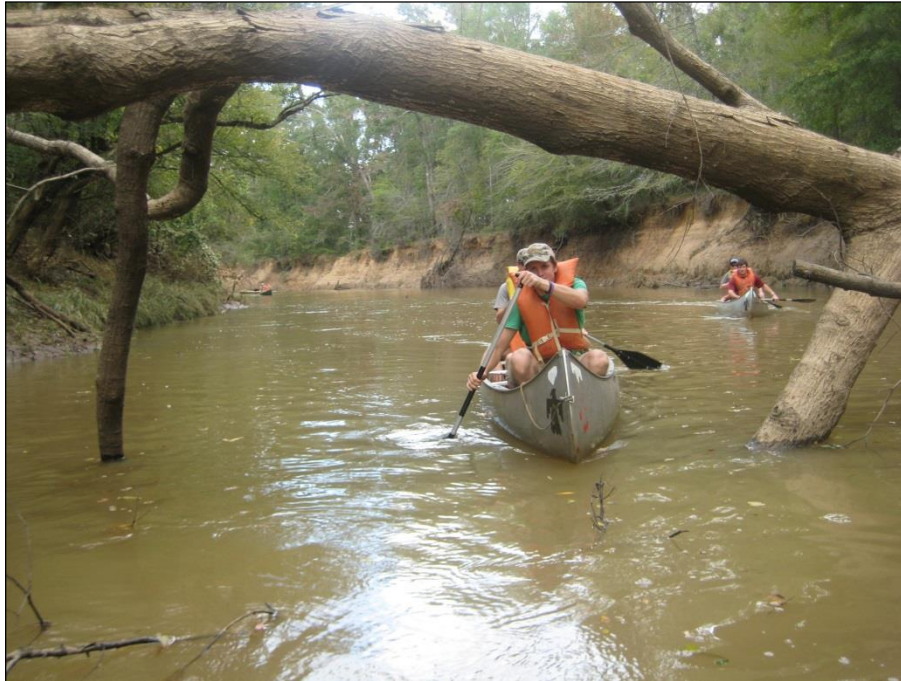
Figure 3. Collaborative teamwork is required for students to complete the Neches River exercise. By the end of the three-hour trip, students develop comradery, a sense of accomplishing an important task, and a connection to the natural resource and profession.