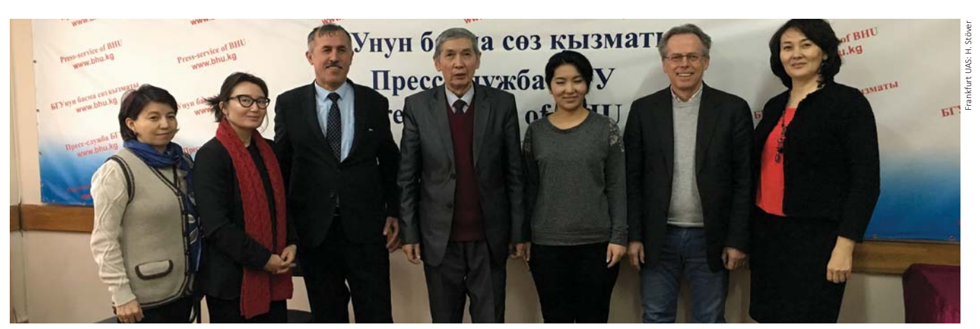
Project meeting in Bishkek, Kyrgyzstan from January 24 till 25, 2018.

Internationalization of science and research: This is the objective tag line under which the project partners – Frankfurt UAS, Bishkek Humanities University, Medical University in Astana, and Tajik National University in Dushanbe – pool their experiences in order to build a long-term strategic scientific cooperation. As part of the international project "InBeAIDS" the partners jointly study the infectious diseases HIV/AIDS and hepatitides among injecting drug consumers. The research team wishes to find answers to the challenges concerning the spread of drug-associated infectious diseases especially by revisiting the increasingly important role of social work as well