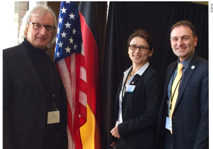
Meeting of German and American deans in Milwaukee, USA.