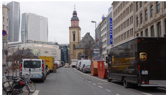
Various CEP service providers are delivering packages in Frankfurt neighborhoods.

More and more consumers order goods from all over the world and have them delivered directly to their homes. Due to this increased demand, courier, express and small package services (CEP), i.e. the companies delivering packages, and local authorities are faced with the challenge to process the resulting increased traffic efficiently and ecologically. As a result new delivery strategies have to be developed; however, there is no data set on traffic-related effects of both