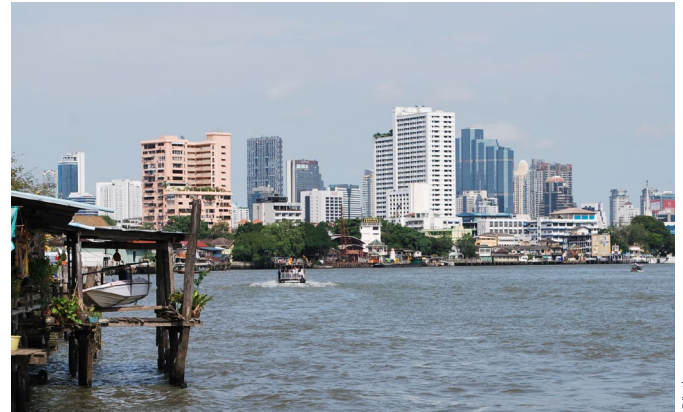
City Bangkok in Thailand.