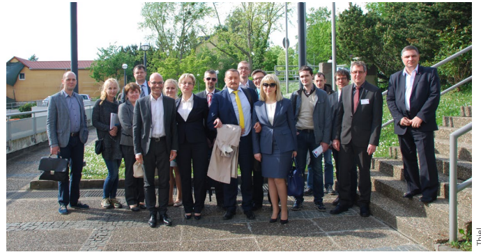
Russian delegation visits Frankfurt and the greater Rhine-Main region.