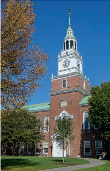
Dartmouth College, Hanover, New Hampshire.

As a young math professor, Kemeny spun exposure to computers from his Los Alamos days into founding college computing. This was in itself an enormous accomplishment. The less known story is how he and his partner, Tom Kurtz, did all the work that led to BASIC and the Dartmouth Time Sharing System, as well as the twists, turns, and inventiveness of their revolutionary thinking and creation. Kemeny was a teacher, a professor in all that he did. From the outset of his work with computers he involved students who wrote the programs, helped to solve problems and figure out bugs, and joined as absolute collaborators with Kemeny and Kurtz.