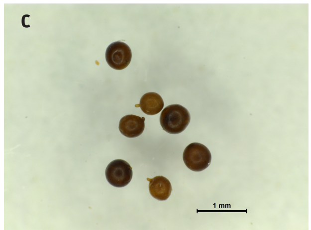
Figure 1 - Extraction methods. A: Fenwick can; B: Cobb's decanting and sieving technique; C: cysts collected.