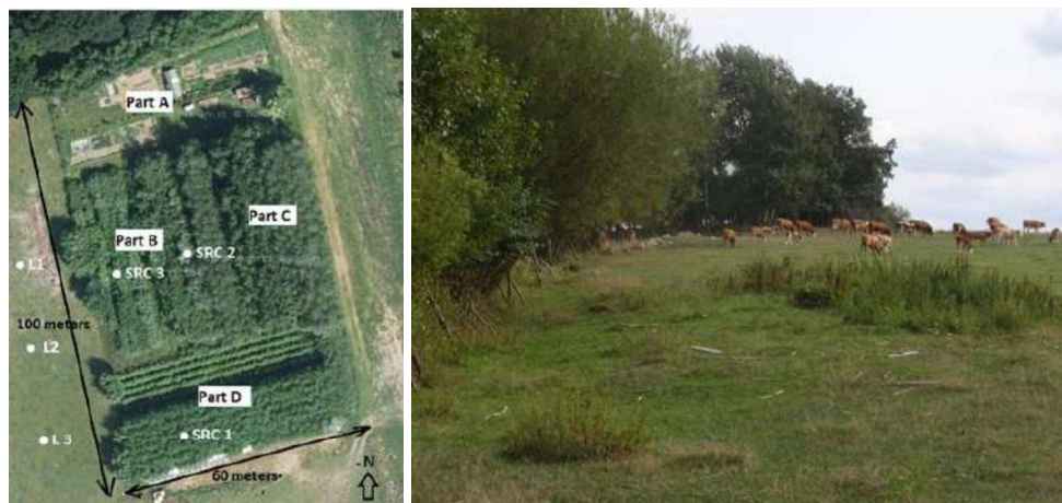
Figure 1: Areal picture of the experimental agroforestry system in Nová Olešná (left) and picture of cattle pasture (right) adjacent to SRC visible on left. ALS plots/parts: A) poplar alley and vegetable garden with henhouse, B) poplar/willow experimental SRC clone test (middle and left), C) poplar/willow SRC for energy biomass (right) and D) poplar stool bed; bullets show soil sampling points (SRC1-3, L1-3) of 2017 soil analysis (comparison of SRC and pasture).

The experimental site is divided into three resp. four different plots on a total area of 0.6 ha (Figure 1). The short rotation coppice part consists of the clone test of poplars and willows (0.2 ha), plantations for firewood/woodchips (0.15 ha) and stool bed for cuttings (reproduction material) on 0.1 ha and a garden used for small-scale vegetable production (0.1) including facilities for small scale poultry farming.