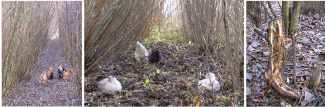
Figure 2: Poultry in poplar willow clonal SRC test (right: rotten wood removed by chicken).

Poultry consisted of typically 20-30 hens with one cock and several specimens of ducks, turkeys and geese over the years, depending on the farmer family needs and other factors, e.g. prey by fox and marten. A henhouse with water and feeder is located inside in vegetable garden plot. Poultry has been fed by locally produced cereals and some commercial pellets ad libitum. The AFS and surrounding grasslands has been managed and owned by Mr. Bartoš family (Figure 2).