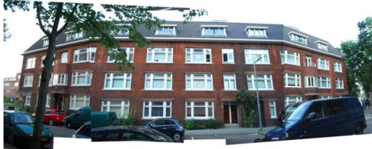
Figure 04. Wallisblock

Housing buildings in poor condition ceded by the city of Rotterdam for zero euros to an initiative led by architects and social managers to put the building into use with the involvement of users in the process of design and partial self-construction.