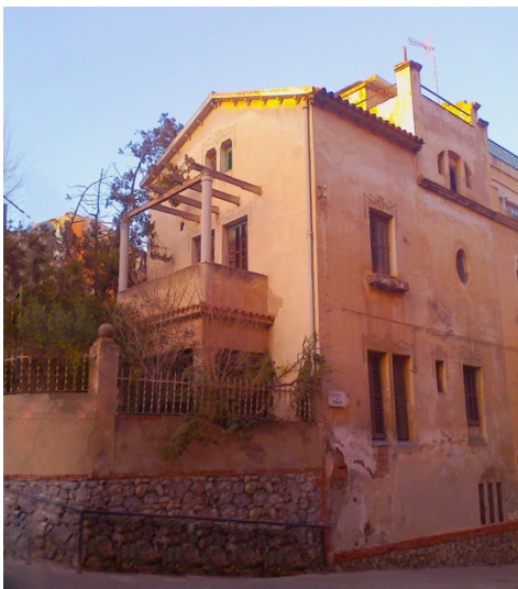
Figure 02. La Mula. https://masoveriaurbana.wordpress.com

The experience of La M.U.L.A. (Masovería Urbana per la Llar Alternative) is a small housing cession experience that shows us the potential that this type of agreements can have: modes of organization and management between empty homeowners and citizens with few resources and important housing needs.