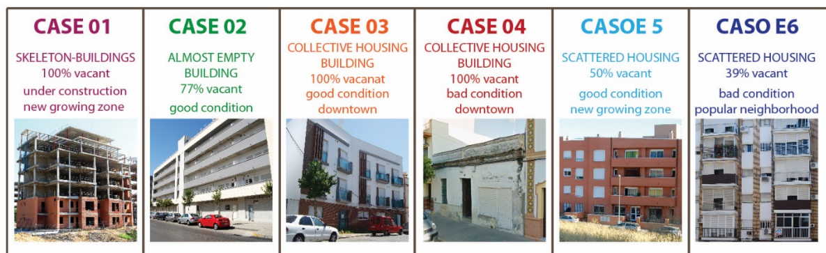
Figure 06. Empty Homes local typologies.

In the context of a municipality in the metropolitan area of the city of Seville, different intervention strategies are proposed, extracted from what has been learned in the study cases, and derived from its diagnosis and the analysis of possibilities adapted to the different typologies of housing vacancies, are proposed as a guide for future interventions.