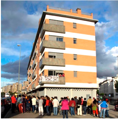
Figure 01. Corrala Utopía.