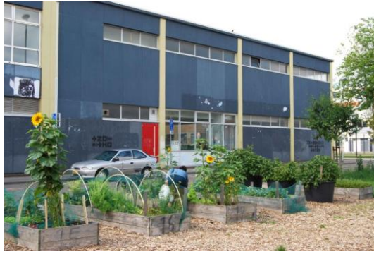
Figure 03. Zoho area.