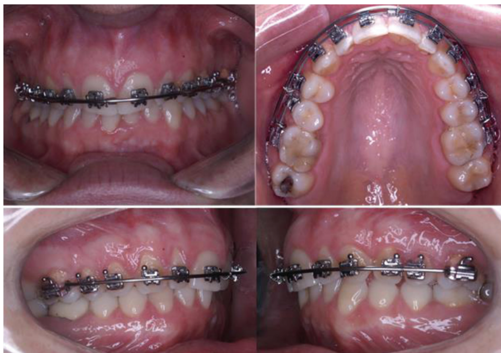
Fig 1: Intraoral photographs of a patient using the TMA auxiliary expansion arch.

All patients had CBCTs performed at the same machine. The tomographic scans were taken with patients in natural head position. The tomograph was the I-CAT (Kavo), and the voxel size used was 0.25mm. Exams were saved in DICOM format, and measurements were made in OsiriX Lite software (version v.7.0.3 32-bit). The software allows multiplanar image visualization. Since only the maxilla was evaluated in CBCT, the palatal plane was used as the horizontal reference (anterior nasal spine to posterior nasal spine). Perpendicular to this plane, passing through the incisive foramen, the median vertical plane was used as a vertical reference. In coronal sectioning, for head position standardization, the palatal contour at the second molar region was used as reference, adjusting the image to be para-