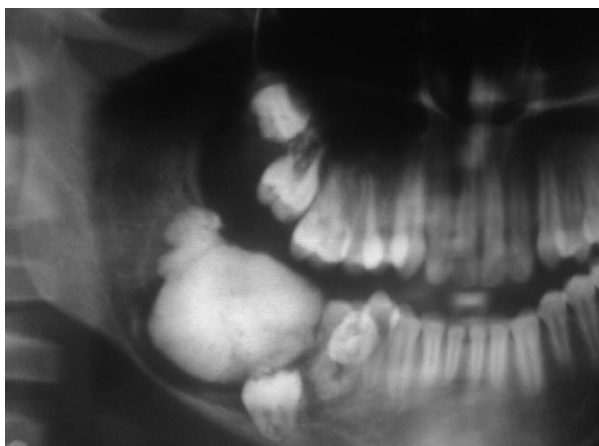
Fig. 2: Complex Odontoma.

to consider that as the odontoma increases in size over time, enough force to cause bone resorption will be produced (23).