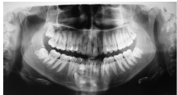
Fig. 3: Mandibular supernumerary canine in the fourth quadrant impeding the eruption of the canine.

One of the present study's objectives was to analyze the clinical consequences of SNCs. Türkkahraman et al. (7) assert that an ST can produce esthetic and functional disorders. Nadal-Valldaura and Viader Codina (8) maintain that when impacted, SNCs may trigger the symptoms that typify impacted teeth in general. Follicular sac expansion/enlargement >3\text{mm} was evaluated as previous studies have considered this a relevant variable. Eliasson et al. (27) and Sewerin and von Wovern (28) studied follicular sac expansion >3\text{mm} in impacted mandibular third molars, concluding that although it was not common – 6% and 5.4 % respectively – histological analysis identified the presence of follicular cysts in these cases. In the present study, 15.38% (CI 95%:5,4%-32,5%) of SNCs presented follicular sac expansion >3\text{mm} ; however, we have no record of later follow-up monitoring to suggest further expansion of the follicular sacs involved. According to the scant literature available, in spite of the hypothetical relation between follicular sac expansion and its evolution into a follicular cyst, this can be considered unusual. Both