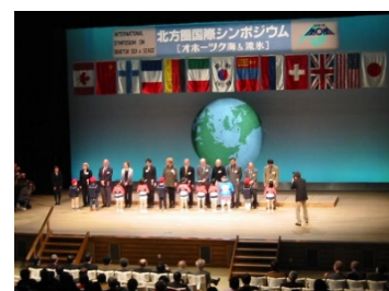
Fig.3 International Symposium on Okhotsk Sea & Polar Oceans