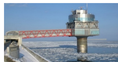
Fig. 5 Okhotsk Tower