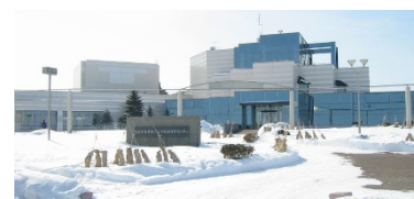
Fig. 4 Okhotsk Sea Ice Museum of Hokkaido