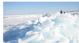
Fig. 2 Sea ice at Mombetsu