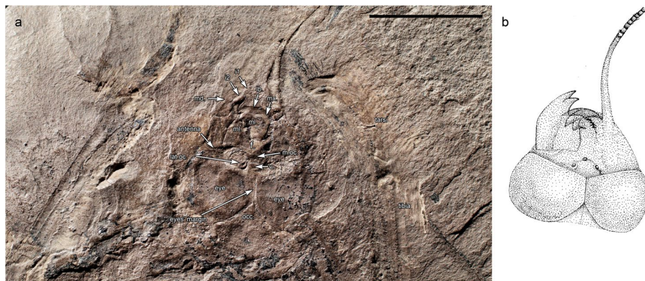
Figure 2. Meganeurites gracilipes Handlirsch, 1919, holotype MNHN R53005, head and fore leg. (a) dorsal view; (b) reconstruction. f. frons, il, i2 incisivum, lb. labrum, lat.oc. lateral ocellus, md. mandible, ml. molar plate, m.oc. median ocellus, mx. Maxilla, occ. occipital triangle, v. vertex (reconstruction M.P.). Scale bar, 10 mm.