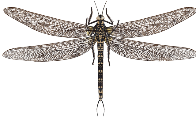
Figure 4. Meganeurites gracilipes Handlirsch, 1919, reconstruction. Pattern of coloration highly hypothetical, adapted from extant relatives, caudal appendages of abdomen corresponding to Namurotypus sippeli (reconstruction M.P.). Scale bar, 10 mm.

were strong, robust, and with large, sharply acute teeth, similar to those of extant Odonata (Fig. 2). The mandibular form and dentition demonstrates that M. gracilipes , and likely all species of the family Meganeuridae, were predators. The short antennae with a flagellum of Meganeurites probably had the same function in flight control as those of extant Odonata 3 . The positions of the three simple eyes (ocelli) on vertex are in the same positions as those of the extant dragonfly family Aeshnidae, supporting similar roles as the horizon detectors which contribute to the balance body control during fast flight maneuvers 4 .