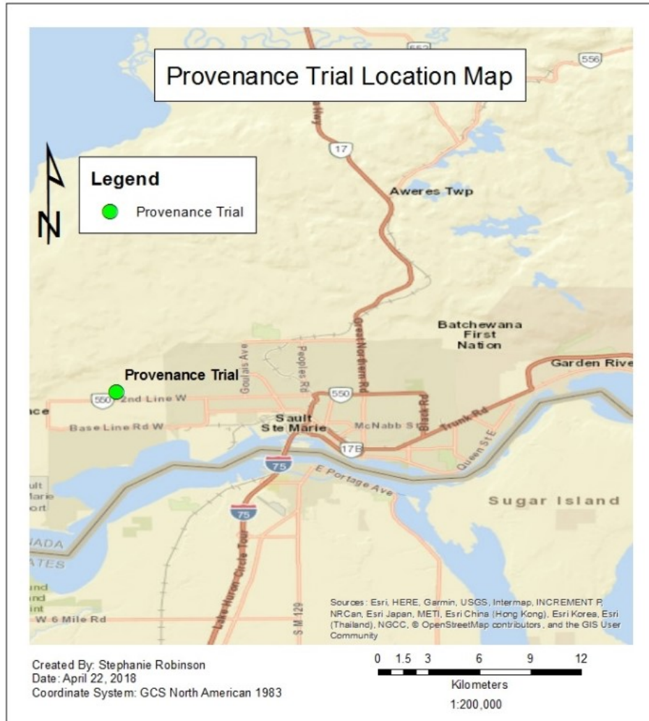
Figure 1. The Sault Ste. Marie black spruce seed source portfolio test location at the OFRI Nursery & Arboretum, Sault Ste. Marie, ON.

A randomized complete block experimental design was used to establish the test (Figure 3). The test is divided into 9 blocks with the 10 seed sources randomly planted in each block as plots of 16 trees (4 x 4 trees). There are 12 seed source plots replicated per block for a total of 1728 trees. The seed source plots in each block are arranged as follows: 9 of the plots are each planted with a different seed source, 2 of the plots are planted with the same seed source (source 6) and 1 plot is planted with a mix of all the