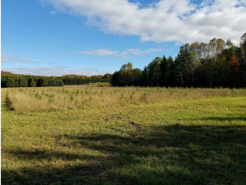
Figure 5. Sault Ste. Marie black spruce seed source portfolio test.