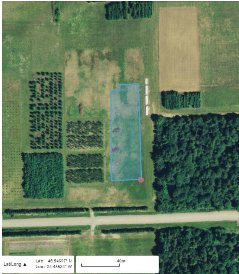
Figure 4. Position and orientation of the Sault Ste. Marie black spruce seed source portfolio test.

The test is located in a heavily tended area surrounded mostly by grass (Figure 4). A small plantation of mature jack pine stand to the west of the test and is positioned halfway along the length of the test. A natural deciduous stand is found just to the east of the test, again positioned halfway along the length of the test. A field of tended grass is located to the north and west of the test.