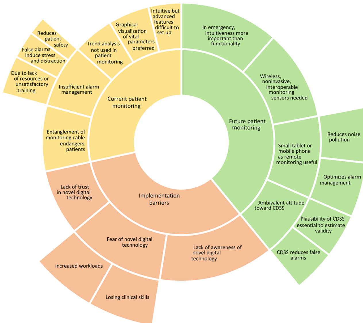
Figure 2. Within three categories (inner ring), 12 themes (middle ring) were identified and specified (outer ring) to reflect the requirements of a novel patient monitoring technology from the view of intensive care staff. CDSS: clinical decision support system.

Most participants saw a need for improvement of patient monitoring in the ICU through novel technology, not only for enhanced efficiency in routine processes, but also to improve patient safety, quality of care, staff satisfaction, and quality of life for patients in the ICU as well as after discharge. Self-evaluation by participants regarding technological savviness using a Likert scale, with scores ranging from 1 ( no affinity for technology ) to 5 ( high affinity for technology ), resulted in the following median scores: physicians, 3.5 (range 2.0-5.0); nurses, 2.8 (range 1.5-4.0); and respiratory therapists, 3.8 (range 3.5-5.0).