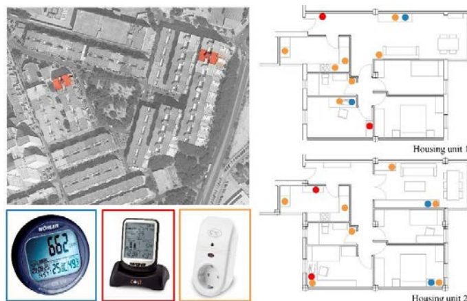
Fig. 3. Monitoring of housing units of the Loreto neighbourhood in Cadiz.

Task 8: Establishment of integrated strategies for sustainable retrofitting of the thermal envelope. After ascertaining the energy conditions of the urban nucleus used as case study, retrofitting solutions are sought to improve the energy efficiency of housing neighbourhoods.