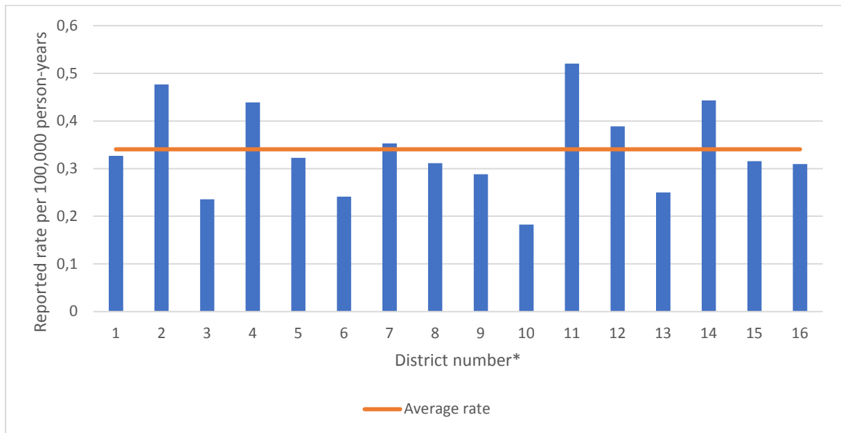
Fig. 1 Reported rate of pneumococcal meningitis by district, Poland, 2005-2015

*1- Dolnośląskie, 2- Kujawsko-pomorskie, 3- Lubelskie, 4- Lubuskie, 5- Łódzkie, 6- Małopolskie, 7- Mazowieckie, 8- Opolskie, 9- Podkarpackie, 10- Podlaskie, 11- Pomorskie, 12- Śląskie, 13- Świętokrzyskie, 14- Warmińsko-mazurskie, 15- Wielkopolskie, 16- Zachodniopomorskie