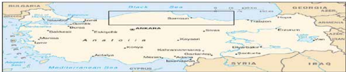
Figure 1- Black Sea Region from which wild narrowleaf birdsfoot trefoil ( Lotus tenuis Waldst. & Kit.) genetic resources were sampled

*, the values in the parenthesis described the codes of population's distribution in Figure 2