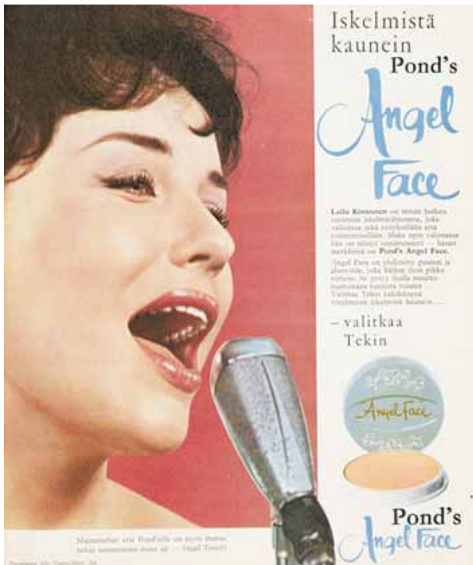
Image 2. Print advertising could not utilise the sound of Laila Kinnunen's voice, but did their best, here in 1963 visualising the vocalist in action and repeating the word 'iskelmä' three times. (The women's magazine Me Naiset , 1963 [10].)