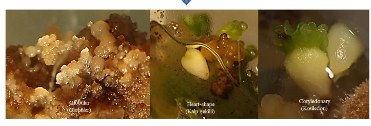
Embryo maturation and somatic embryos in different stages (Embriyo olgunlaşması ve farklı aşamalarda somatik embriyolar)