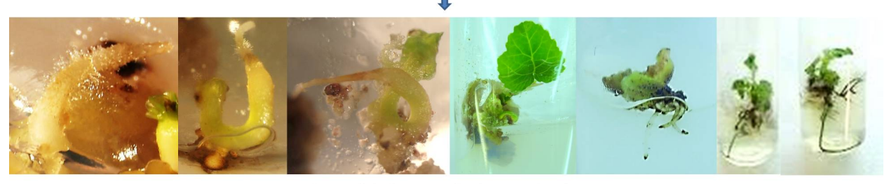
Organ and plantlet regeneration from somatic embryo (Somatik embriyodan organ ve bitkicik rejenerasyonu)

Figure 1. Somatic embryogenesis and plantlet regeneration in cotton ( Gossypium hirsutum L.) genotype Nazilli-143. Şekil 1. Nazilli-143 pamuk ( Gossypium hirsutum L.) genotipinde somatik embriyogenez ve bitkicik rejenerasyonu.