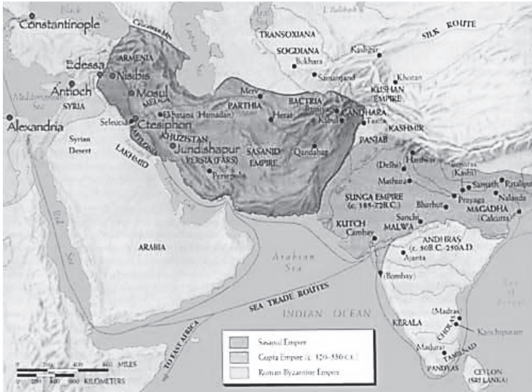
Fig 1. Map of Sassanid Empire and Jundishapur 3

Panchatantra has its own story of moving from places to places and from one language to other language. During the last 1500 years there are at least 200 translations of Panchatantra in about 60 languages of the World. Aesop fables, Arabian Nights, Sindbad and more than 30 to 50% of Western nursery rhymes and Ballads have their origin in Panchatantra and Jataka stories (Dudes 1995). Traditionally in India it is believed that Panchatantra was composed around 300 BC (Jacobs 1888). 4