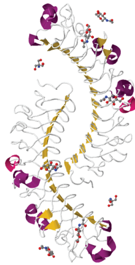
FIGURE 1: Structure of decorin : mammalian decorin (DCN) contains a monomeric protein core of 42 kDa and a single chondroitin/dermatan sulfate glycosaminoglycan (GAG) chain. DCN exists as a dimer in physiological solutions and is the best characterized member of the growing family of SLRPs. Structurally, it has a domain of tandem leucine-rich repeats (LRRs, altogether 12 LRRs), flanked on both sides by two cysteine-rich regions. Decorin dimer structure (from PDB 1XKU). Images prepared with JMOL program. The N-terminus is in the “middle” of the antiparallel homodimer.