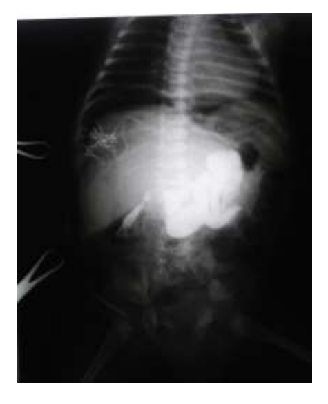
Figure 3: Intraoperative Colangiography

This case is about the rare association of BA with infantile cutaneous hemangioma. BA is a rare abnormality. In BA, one or more bile ducts are absent or narrow abnormally<sup>[2]</sup>. Infantile hemangioma is a common childhood benign vascular tumor. The prevalence is 5-10% among neonates and infants <sup>[25]</sup>. There was no clear association between facial hemangioma and BA in the literature yet, but there was the report on a 4-month-old girl with multifocal hemangioendothelial and multiple cutaneous hemangiomas whose mother had been born with nonsyndrome type 3 BA. When the mother was 16 years old, the liver transplantation was done. She had been taking medication with tacrolimus, azathioprine and ursodeoxycholic acid during pregnancy. The paper maintained that the association of girl's hemangiomas and her mother's biliary atresia may be more than