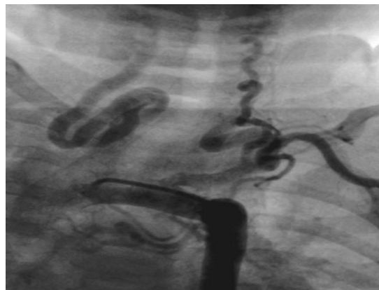
Figure 1: Tortuosity in aortic arch branches (brachiocephalic and carotid)

Right oxygen saturation was normal but the right ventricular pressure was increased to 60 mmHg. The pressure between pulmonary trunk and it right and left branches was 40 mmHg. There was a slight right ventricular hypertrophy with severe stenosis of pulmonary artery bifurcation site (peripheral pulmonary stenosis, type II-A) (fig 3). The patient is survive after one year follow up and didn't need any intervention for her cardiac problem right now.