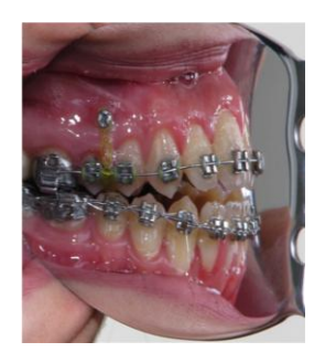
Figure 3. Presurgical records

Then orthognathic surgery was done according to determined treatment plan. After surgery, finishing phase of orthodontic treatment was done and for retention phase a lingual bonded retainer in mandible and Hawley retainer in maxilla were prescribed. Furthermore, the training of tongue posture was given