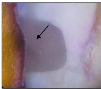
Figure1. Illustration of specimen with no leakage (Score0)

* The level of significance was considered at p<0.05