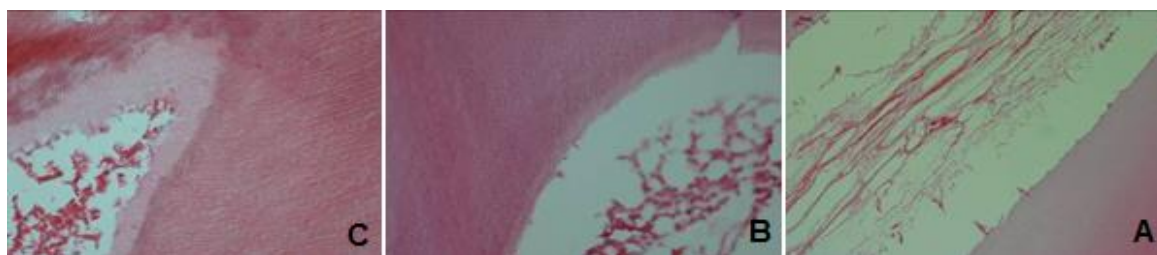
Figure 2. Absence of predentin (A) thin layer of predentin (B) thick layer of predentin (C) (H&E staining×40)