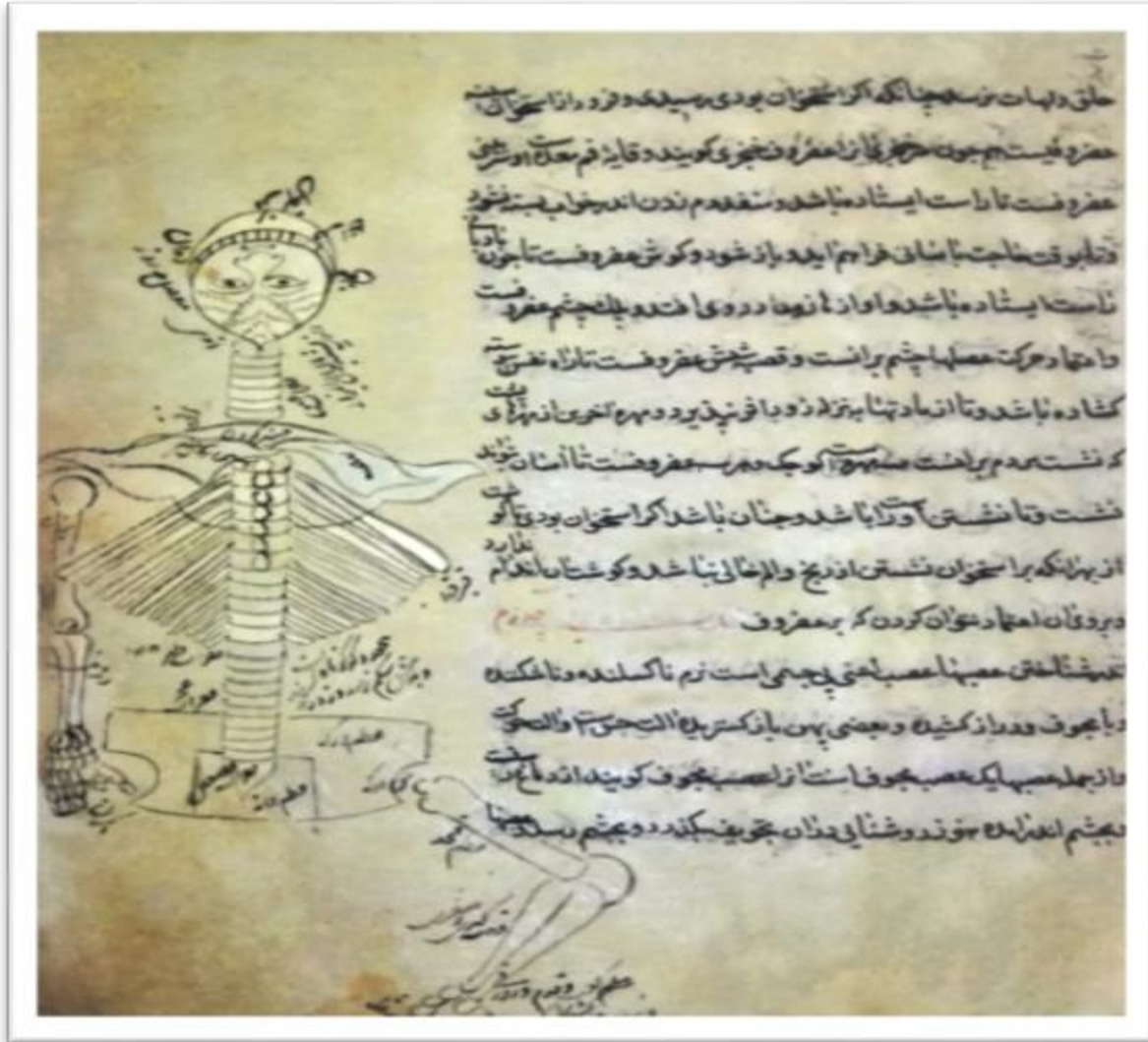
Figure1. From a copy of lithograph edition of Gharabadin Shafahi of selected pictures on History of Medicine in Islam and Iran (page 43)

In this study, we want to introduce this category of drugs known as digesters or jawarishes.